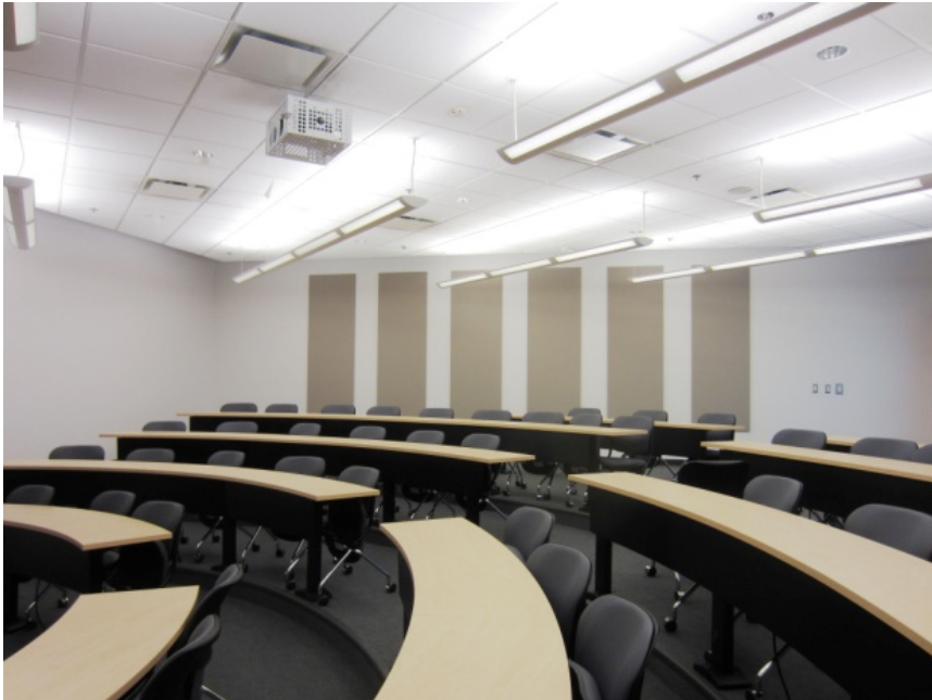
WO 25/35, 2012